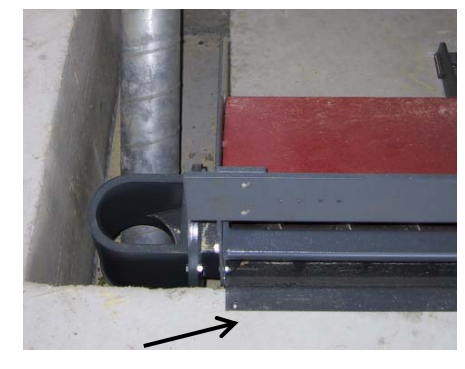
The flange is placed on the edge of the pit