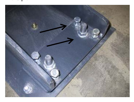
Adjusting screws and M16 bolts.