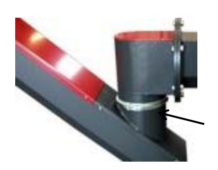
Auger fixed to outlet of scraper system by means of the pipe-clamp