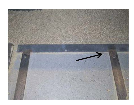
Rails welded together with flange of scrape system.